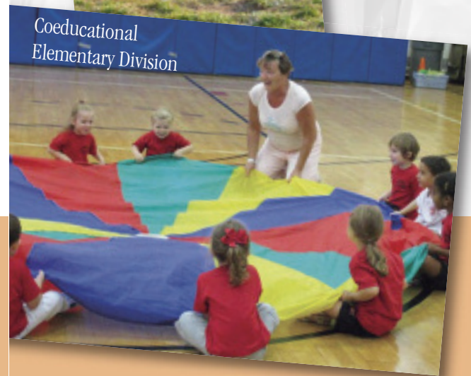
Coeducational Elementary Division